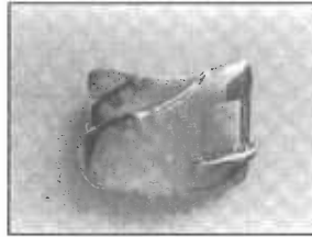
The Vaquero buckle

30. Figure 4 exemplifies a physical item that has at least one purpose other than to serve as the substrate for an expressive work, i.e. , it can hold up a pair of trousers. In the eyes of the Copyright Act, it therefore qualifies as a “useful article,” which the statute defines as follows: