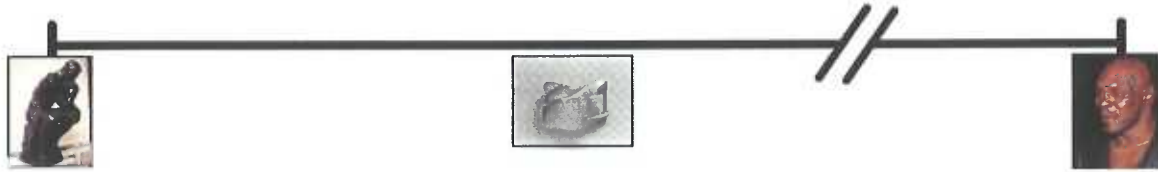
Spectrum of Non-Expressive Utility

38. For each of us, our own bodies are of supreme worth, making any artwork that a person might happen to own pale into insignificance by comparison. The irony of this particular case is that Mr. Tyson, a retired professional athlete, has earned his livelihood from his body. Thus, it would be difficult to imagine a worse test case than this one to vindicate the proposition that the body of someone bearing a tattoo serves no functionality, other than to exist as the substrate for a third party's artistic expression.